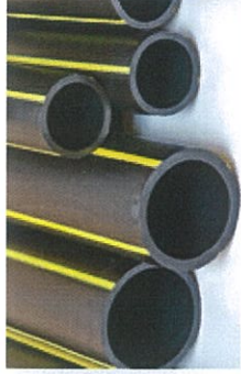
HDPE Gas Pipes