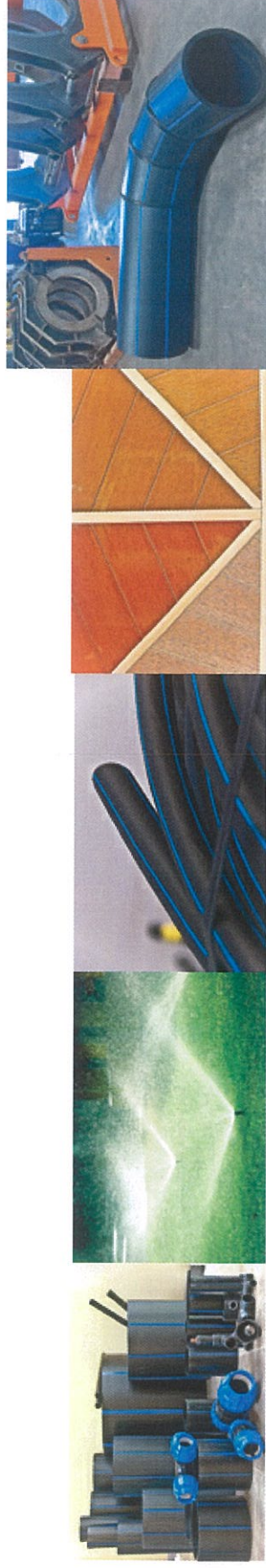
HDPE Pressure Pipes & Fittings