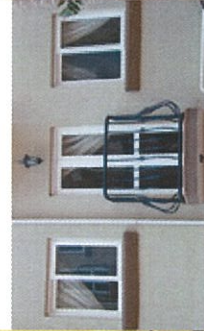
EVERLAST Doors & Windows